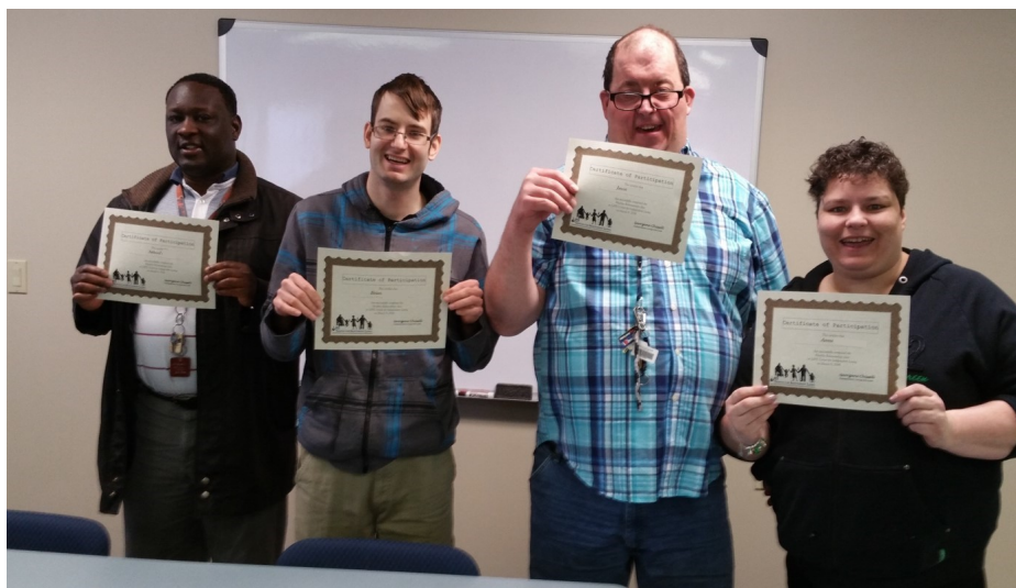
Photo: Four participants of the Healthy Relationships class pose with their certificates of completion at graduation on March 9, 2018.

LIFE CIL plans to offer the class again in the fall of 2018. Please call us at 309-663-5433 if you are interested in being contacted when the fall class is scheduled.